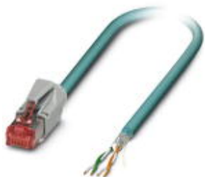
Assembled Ethernet cable, CAT5e, shielded, 2-pair, AWG 26 stranded (7-wire), RAL 5021 (water blue), RJ45 plug/IP20 on free conductor end, line, length 1 m

Please be informed that the data shown in this PDF Document is generated from our Online Catalog. Please find the complete data in the user's documentation. Our General Terms of Use for Downloads are valid ( http://phoenixcontact.com/download )