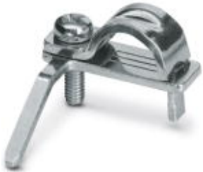
Shield connection clip for printed circuit terminal block

Please be informed that the data shown in this PDF Document is generated from our Online Catalog. Please find the complete data in the user's documentation. Our General Terms of Use for Downloads are valid ( http://phoenixcontact.com/download )