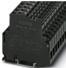
Electronic circuit breaker, signal contact: 1 N/C contact, nominal current: 10 A

Please be informed that the data shown in this PDF Document is generated from our Online Catalog. Please find the complete data in the user's documentation. Our General Terms of Use for Downloads are valid ( http://phoenixcontact.com/download )